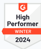
Best of 2024