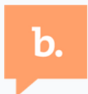
Best of 2022