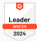
Best of 2024