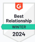
Best of 2024