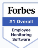
Best of 2023